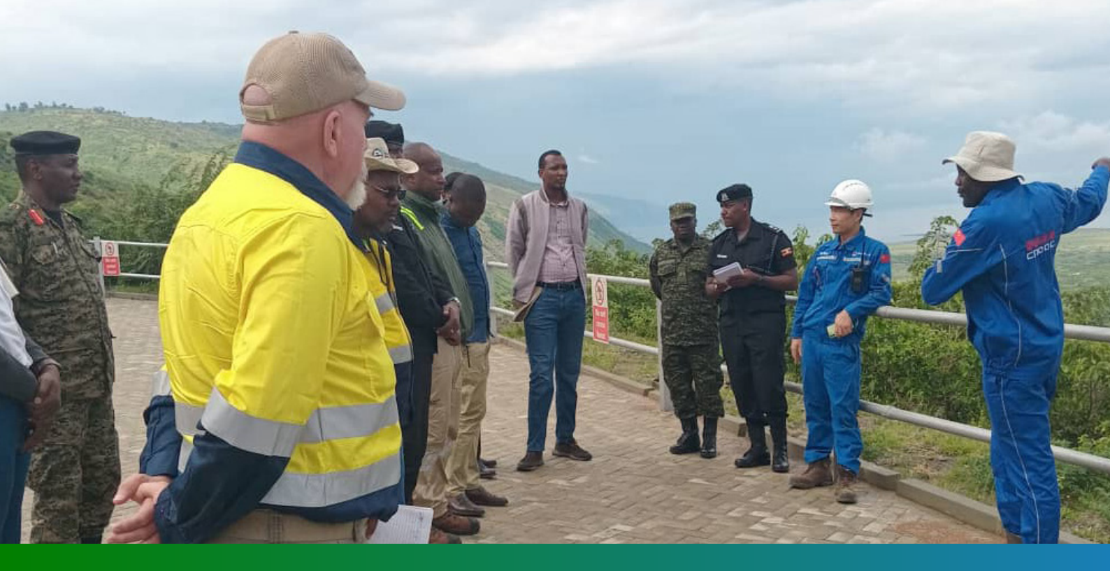
Host Government Agreement Security Committee members visiting King fisher oil fields