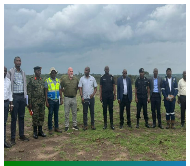
Joint Security Council team at Main Camp and Pipe Yard 3, in Sembabule District