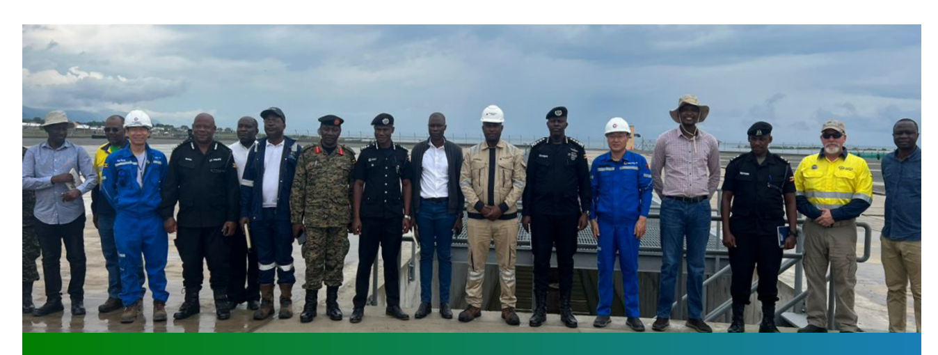
The Host Government Agreement Committee at Kingfisher 2

collective commitment to the success of the EACOP project. By identifying potential risks and implementing tailored security measures, the project is confidently striding towards success. The Security Report on the visit serves as a comprehensive overview of the key highlights and challenges identified by the Host Government Agreement Security Committee during their reconnaissance tour. These insights will be pivotal in fortifying the security framework of the EACOP project. The positive collaborations and proactive approaches witnessed throughout the tour underscore a shared commitment to the project's success. With vigilant community engagement and cross-border cooperation, the EACOP project stands poised for a prosperous future.