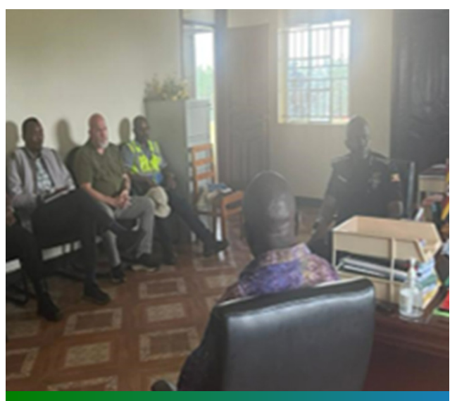
Joint Security Council Meeting with District Security Committee Sembabule and LC V

The Host Government Agreement Joint Security Committee stands as a testament to the collaborative spirit between the Ugandan government and EACOP Limited, working tirelessly to ensure the security and success of the East African Crude Oil Pipeline Project.