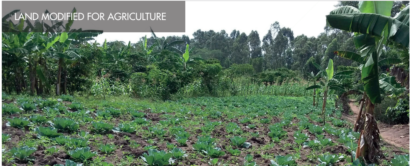
LAND MODIFIED FOR AGRICULTURE

Groundwater bodies in the area of influence are recharged by rainfall and range from low to very high vulnerability depending on how easily water flows through the rock and depth to the water table.