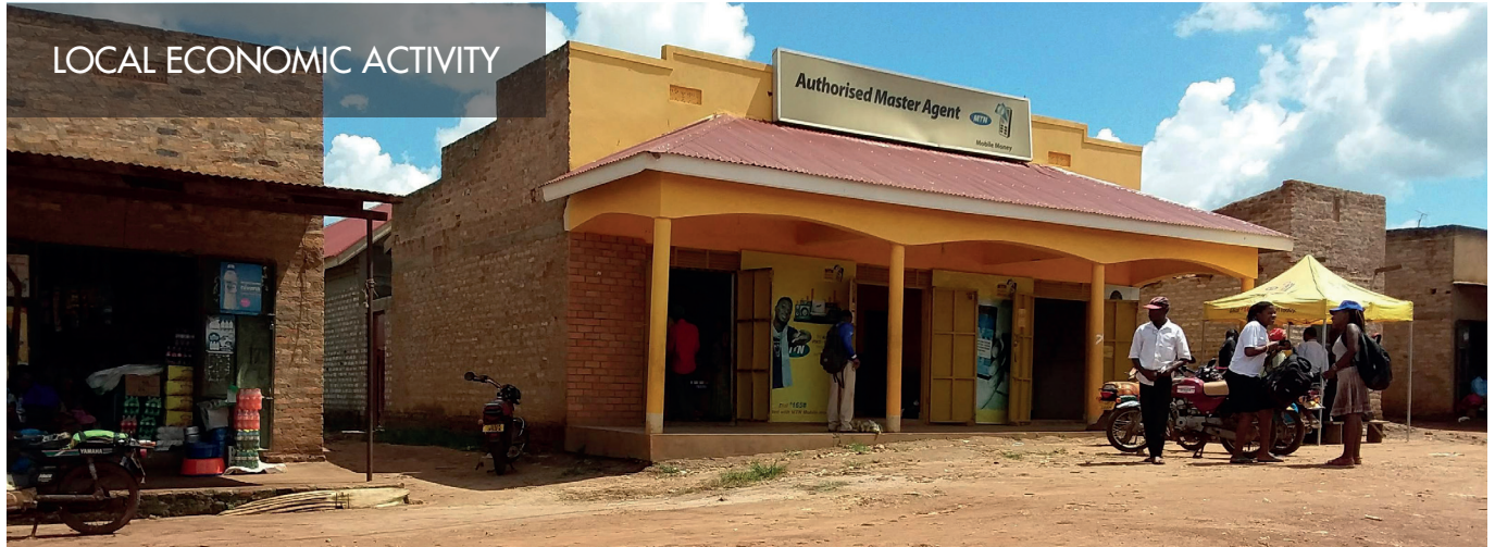
LOCAL ECONOMIC ACTIVITY